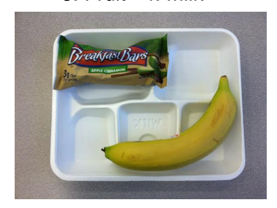
1,2. Entrée (2 grains)