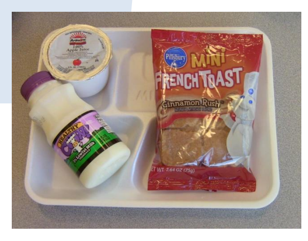
1,2. Entrée (2 grains)