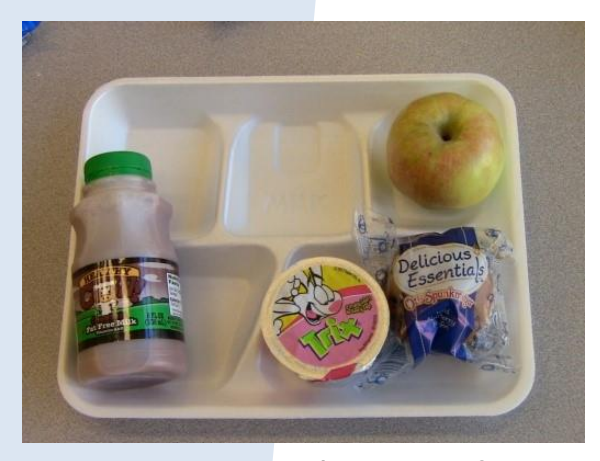
1,2. Entree' (1 grain & 1 meat/meat alternative)3. Milk 4. Fruit

A student needs 3 out of the 4 components in order for a meal to be considered reimbursable. One of these components must be a fruit and or a vegetable. However, they can take all 4 components for the same price!