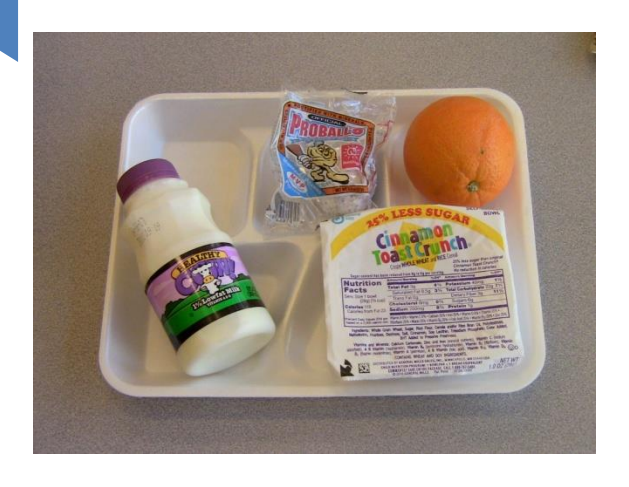
1,2. Entrée (2 grains)